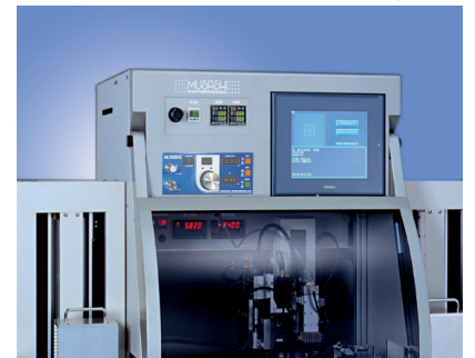
装置搭載例 ML-5000XII mounted

“Dispensing Accuracy” that we have upgrade.