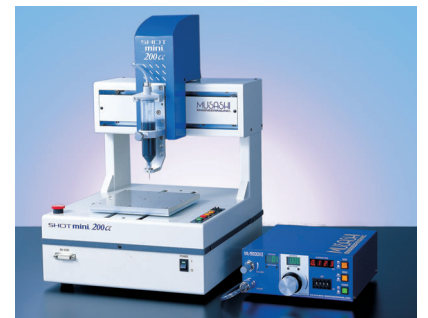
卓上ロボットシステム例 ML-5000XII-integrated desktop robot system